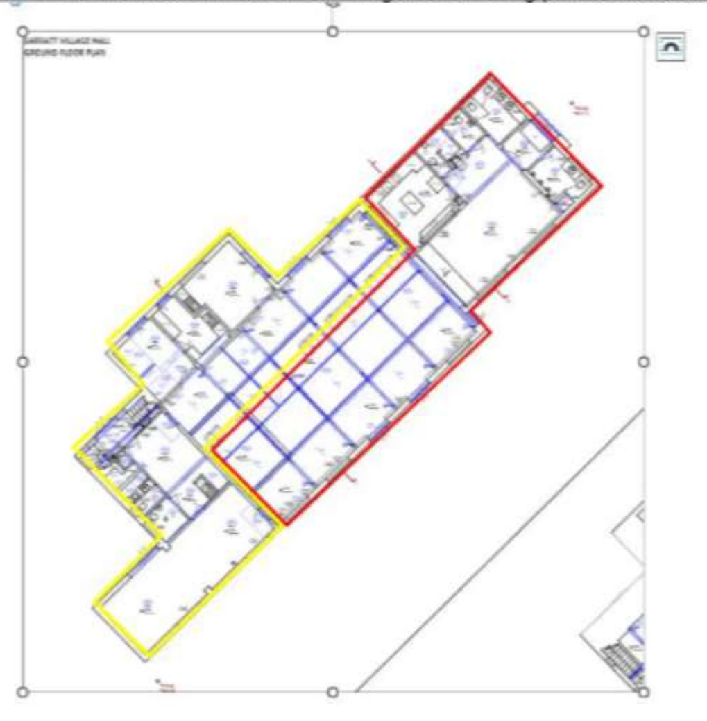
Figure 1. Ground Floor Plan of Sarratt Village Hall showing previous extensions

7.1.7 The existing footprint is currently 106% greater than the original, with the proposed footprint (following the extensions) being approximately 113% greater than the original. Additionally, it is clear that the building has also already been significantly enlarged in terms of its depth and width compared to the original. In light of the existing situation and when viewed cumulatively with earlier additions, the extension of the building would result in disproportionate additions over and above the size of the original building. The proposal would therefore not meet the exception at 154 (c) of the NPPF and would therefore be considered inappropriate development by definition.